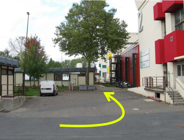
LULI 403 building entrance